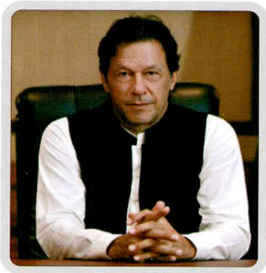
Mr. Imran Khan Prime Minister of Pakistan