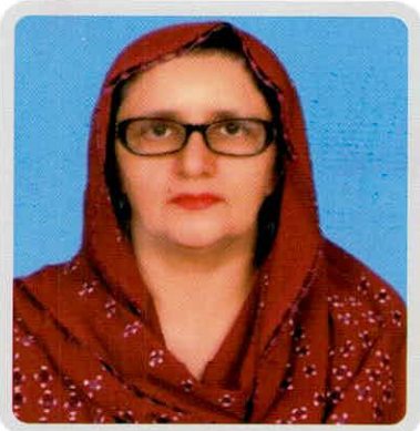
Ms. Zobaida Jalal Federal Minister for Defence Production